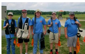
Spring Rive Jr Squad