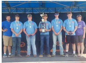
Eleven Point River Sr Squad