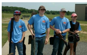
Black River Sr Squad