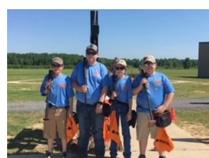
Current River Jr Squad